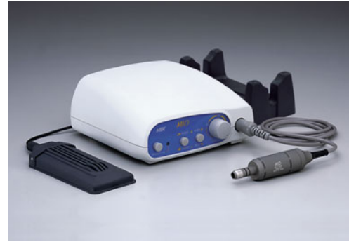
E-Type Micromotor System without Handpiece