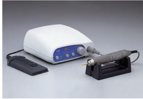
Standard Micromotor System